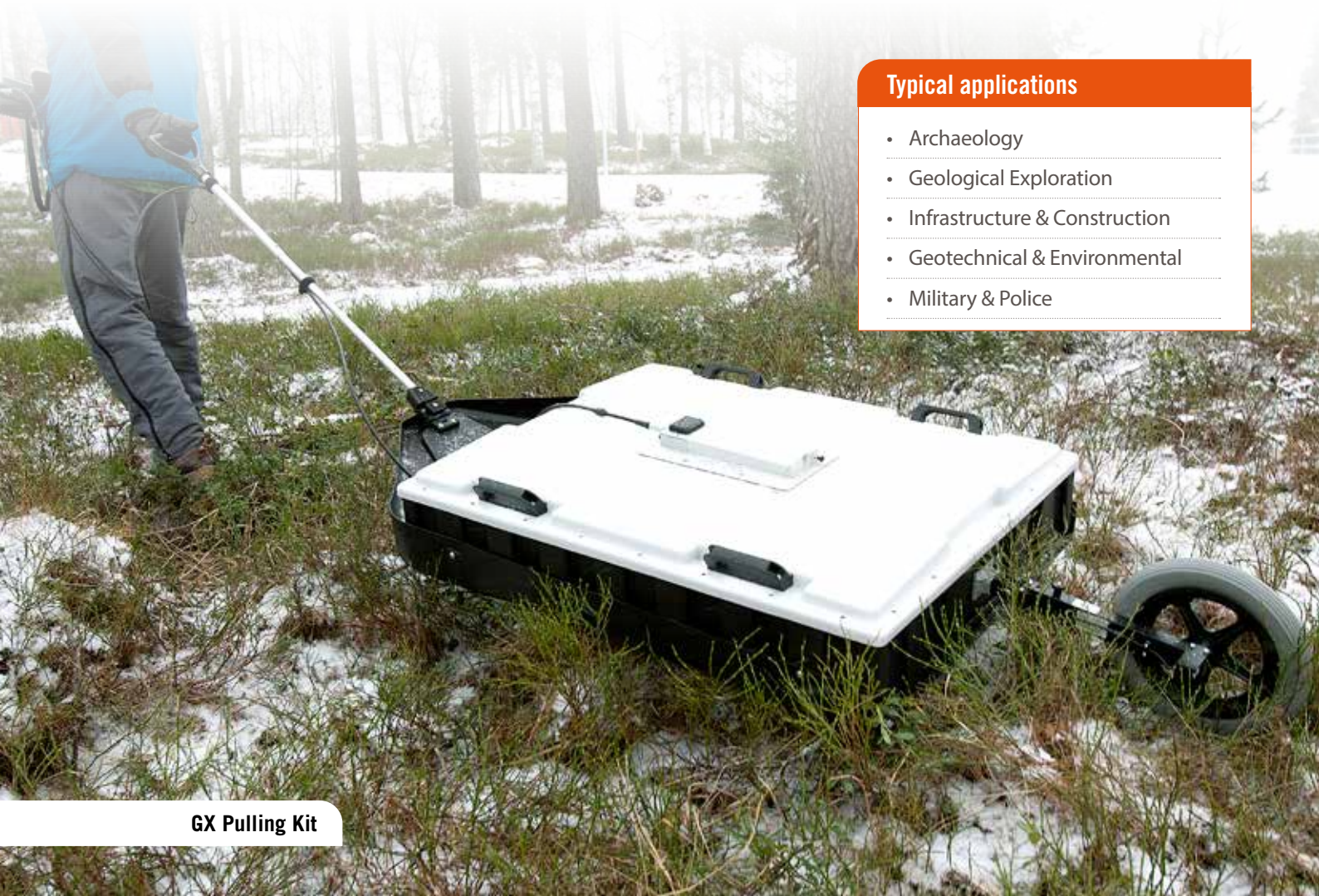
GX Pulling Kit