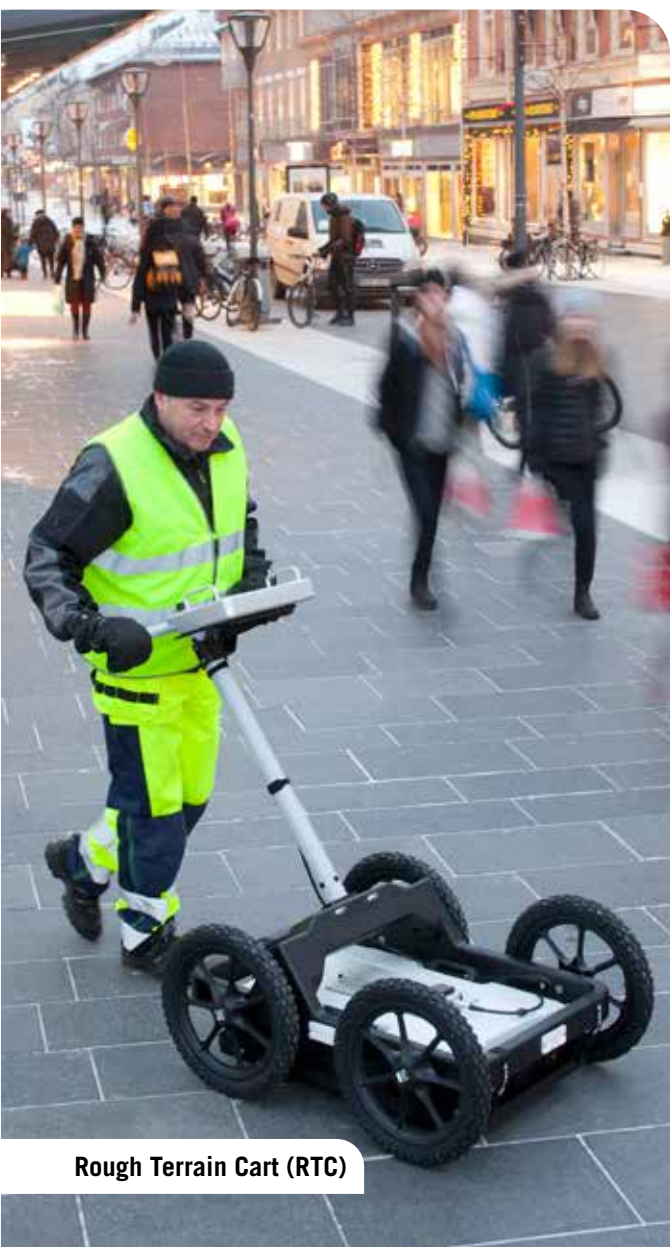
Rough Terrain Cart (RTC)

The choice of antenna frequency will be governed by your application and the desired depth penetration and resolution. All new MALÅ Ground Explorer antennas are app-enabled, and come with WiFi connection per default. This enables full integration with MALÅ Controller app and MALÅ Vision.