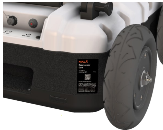
Label with information on serial number and QR code.

For the hotspot, change the network name (SSID) to MALAXxxxxxxx , where xxxxxxx refers to the serial number and change the password for the mobile hotspot to mala0123 .