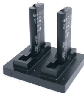
External dual battery charger

The batteries are charged in an external RRC charger, where both batteries can be charged at the same time.