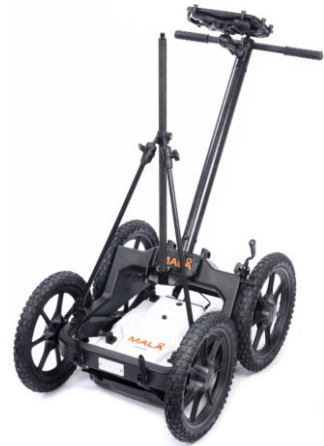
RTC Mini with optional GPS/Prism attachment