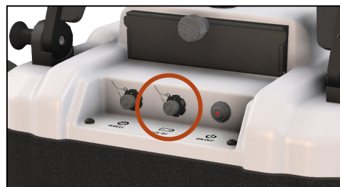
Power connector for an external power source.

The 12V DC connector on the Easy Locator Core can power the Easy Locator Core from the optional MALÅ Battery Bag and batteries.