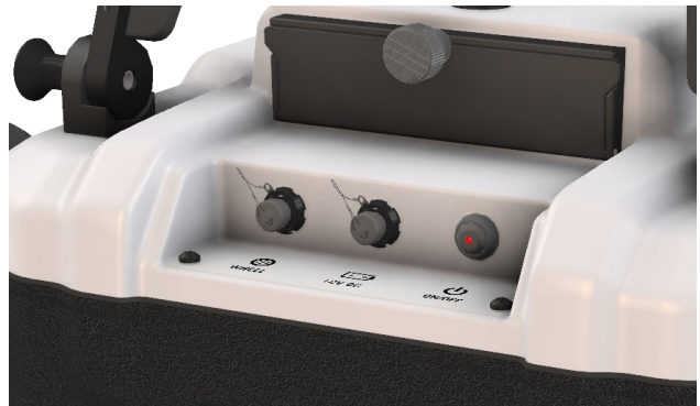
The batteries are found under the black lid. It is possible to hot-swap, one battery at a time, during measurements.

Press the ON/OFF button to start the Easy Locator Core.