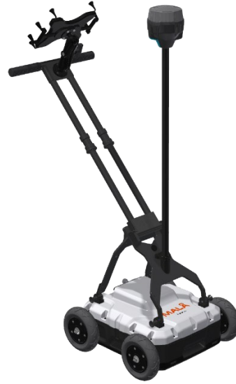
The tablet is attached to the tablet holder on the top part of the handle. The GNSS device or Total Stations prisms (on top of an extension pole) is attached to the GNSS bracket with a quick release mechanism.

The rear left wheel has an internal encoder for data triggering and precise distance measurements.