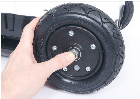
Press the quick-release pin and pull the wheel to remove it.