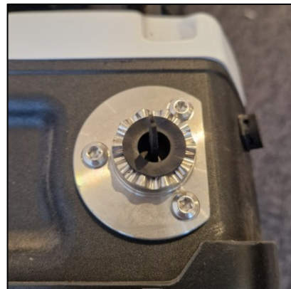
The sealing plug inserted in the axle recess.

Insert the antenna into the RTC Mini and connect the encoder wheel from the RTC Mini to the external wheel port on the rear of the antenna. Next, place the tablet into the tablet holder.