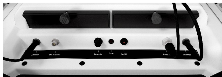
Figure 3. Battery compartments and connector panel.

Press the On/Off button to start the MIRA Compact. Wait for a steady light; the system is now ready to be connected to the MIRA Controller software. To power off, press and hold the On/Off button for 3 s.