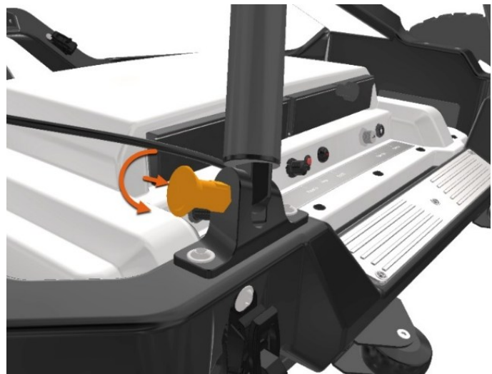
Figure 2. Lock the plunger by rotating the knob and pushing it in, to secure the support arms.

Mount your laptop securely on the laptop holder, use the included Havis owner's manual for adjustment instructions. Use the quick-release clamp to secure the GNSS antenna or Total Station prism. If using a longer pole, it is recommended to use the MALÅ GNSS support arms for stability (optional accessory). Make sure the encoder cable is connected between the antenna box and the frame. Connect the ethernet cable between antenna and laptop. If needed, connect the included USB-C cable for charging your laptop or GNSS antenna.