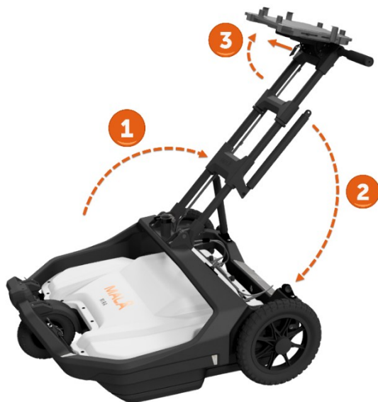
Figure 1. Unfold handle and lower the support arms. Pull MALÅ lanyard to unfold laptop holder.